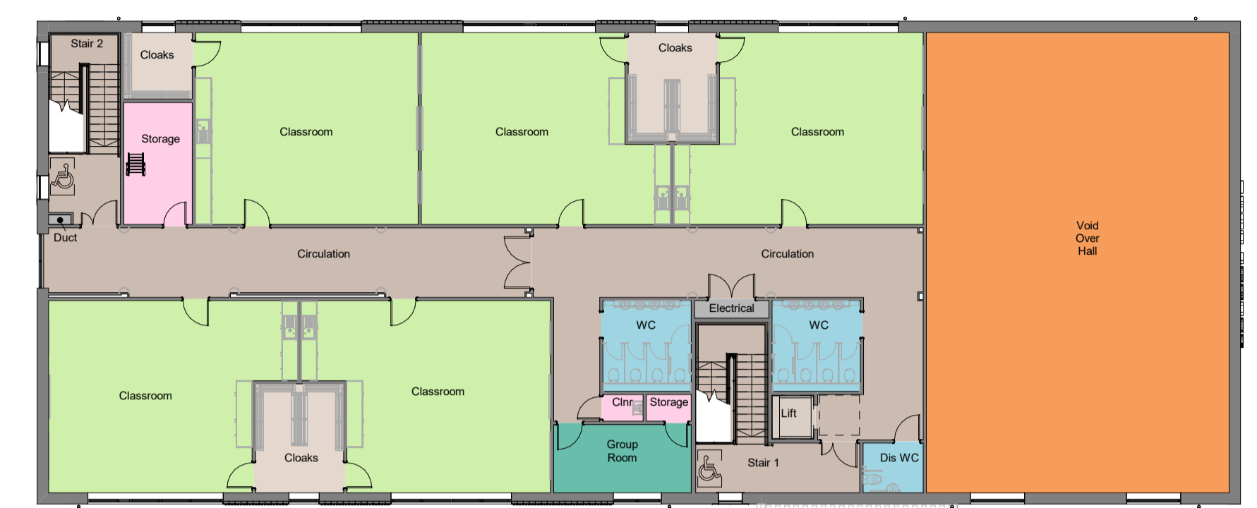
First Floor 1 : 200