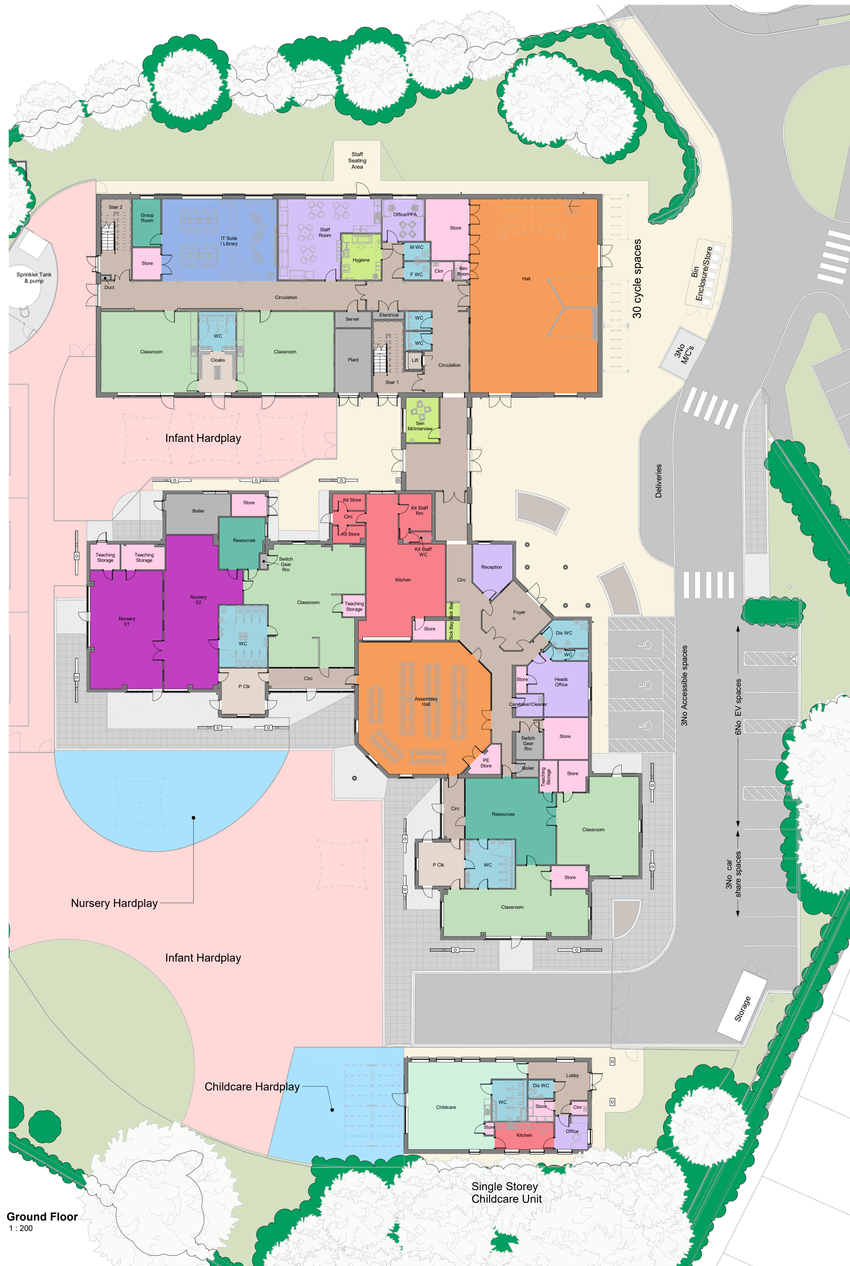
Ground Floor 1 : 200