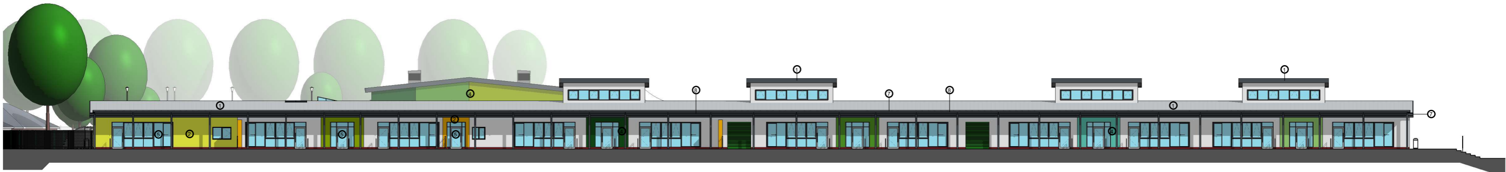
Gwedd dde-orllewinol arfaethedig Proposed South West Elevation 1 : 125