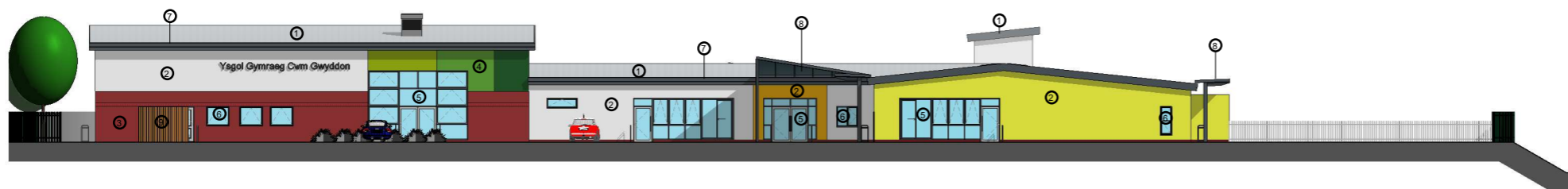
Gwedd ogledd-orllewinol arfaethedig Proposed North West Elevation 1 : 125